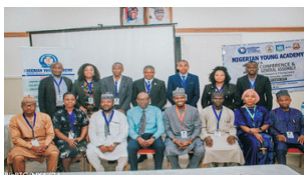
Inducted members with the Executive Committee