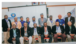
Exiting members with the Executive Committee

It is crucial to mention that the 14th International Conference and General Assembly was sponsored by Yobe State Government and Biomedical Science Research & Training Centre (BioRTC), Yobe State University. In general, the conference was a huge success! Thank you.