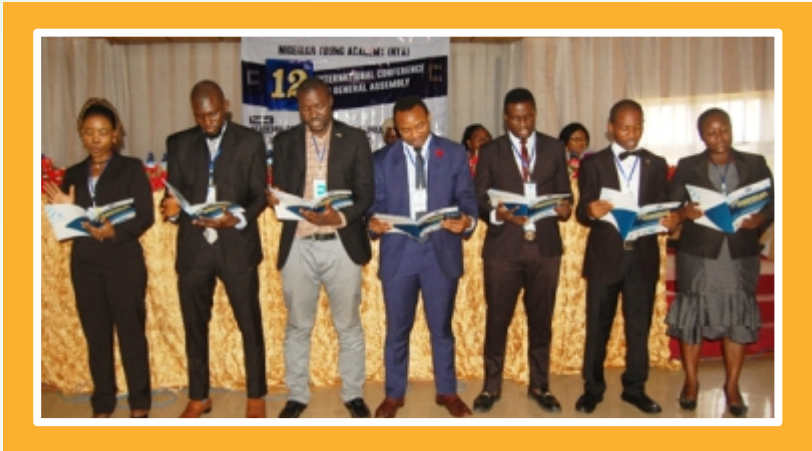
A cross-section of new members taking their oath administered by the President of NAS at the opening ceremony of the 2022 NYA international conference held at the University of Nigeria, Nsukka, Enugu State