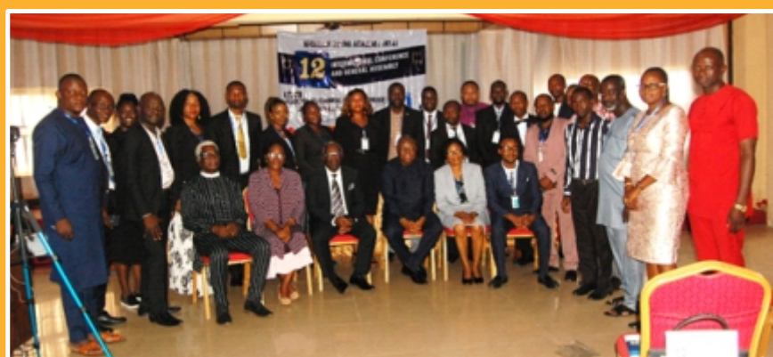
A cross-section of members, new fellows and dignitaries during the 12 th NYA international conference opening ceremony at the University of Nigeria, Nsukka, Enugu State

The 12 th NYA international conference and general assembly were one of the memorable events in the Academy's annual series of NYA conferences since its inauguration on the 30 th of August 2010 at the Redeemers University, Mowe. The conference, themed “Academia-Government-Industry Linkage and Sustainable Development” was held between the 15 th and 18 th of November, 2022. The conference aimed to identify sustainable strategies for spurring academia-government-industry linkage, spur debate on efficient ways to strengthen academia, government and industry collaboration for achieving sustainable development goals, and highlight a multi-sectoral and multidisciplinary roadmap towards tackling and triumphing over sustainable development challenges in Africa and beyond.