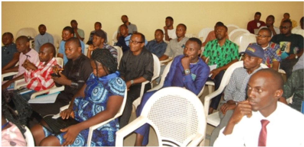
A cross-section of participants at the antiplagiarism workshop held at the University of Nigeria, Nsukka

During the 12 th NYA International Conference General Assembly, the Academy organized an antiplagiarism workshop in collaboration with the African Centre of Excellence for Sustainable Power and Energy Development (ACE-SPED) which was held concurrently at the University of Nigeria, Nsukka, Enugu State.