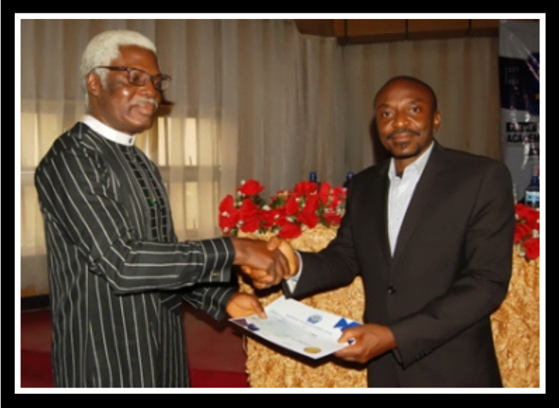
A photo of an award winner receiving an award during the 12 th NYA international conference opening ceremony at the University of Nigeria, Nsukka

The NYA also featured the National Young Researchers' Prizes in Health Sciences, Chemical Sciences and Women in Chemical Sciences, Linguistics, Geoenvironmental Sciences, Mathematical Sciences, and Microbiology. Seven (7) outstanding young researchers were awarded the National Young Researchers' Prizes. These prizes were established to recognize the scientific achievements of outstanding young researchers living and working in Nigeria in their respective fields to encourage them to continue to strive for excellence in their research. The prize awardees are shown below: